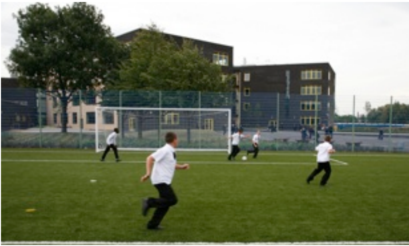
The All Weather Pitch is put to good use at lunch time.