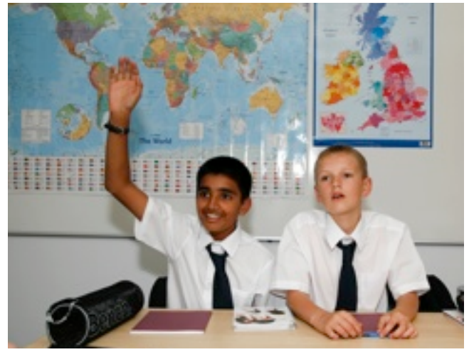
Lets get learning !

All pupils had first day Form Tutor Group pictures taken by local photographer Len Grant.